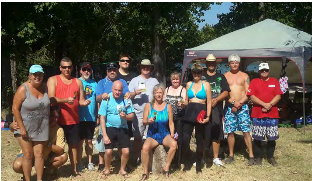
Big Winners at Athens!!