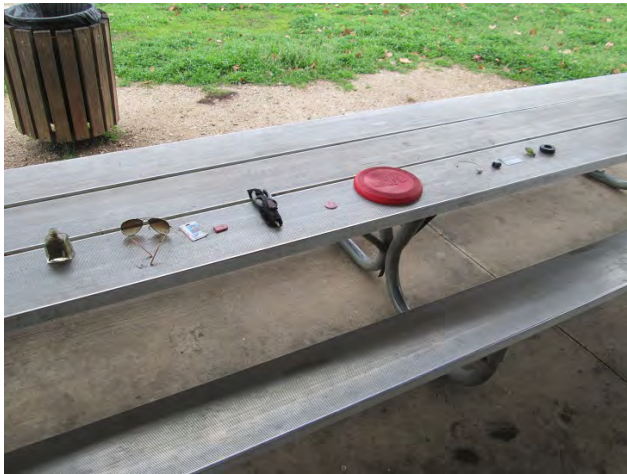
Most unusual item candidates on display – Ted’s poker chip in middle