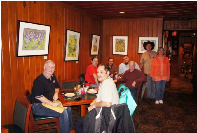
Crew at dinner at Palmer’s restaurant