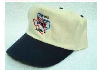
NAVY & NATURAL