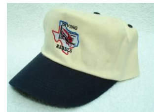
NAVY & NATURAL