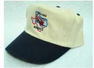
NAVY & NATURAL