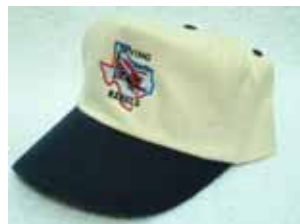
NAVY & NATURAL