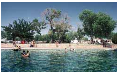
San Solomon Springs